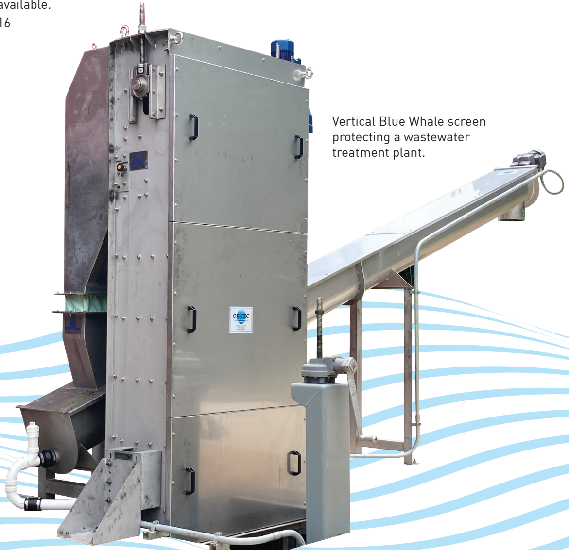
Vertical Blue Whale screen protecting a wastewater treatment plant.