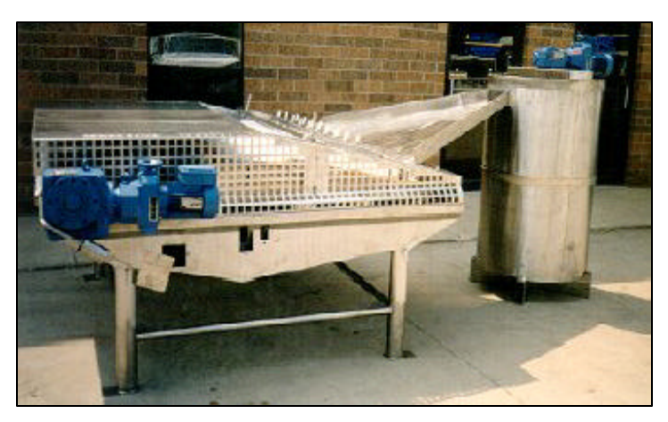
HP Series Belt Press & Flocculation Tank

A premier manufacturer of quality equipment in the Municipal, Industrial, Food Processing and Agricultural Marketplace